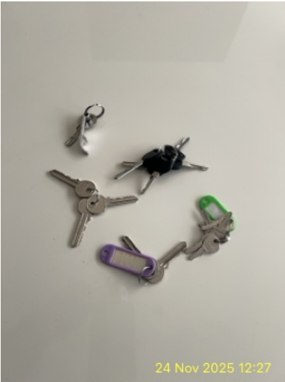
Front door key/s, meter key